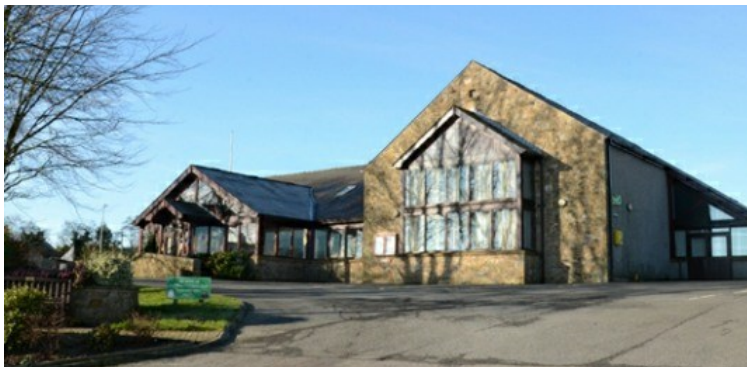
Chipping Day Out in September, details in church

"Lines like 'Give us this day our daily bread' speak powerfully to today's challenges, reminding us to seek sufficiency, not excess, and to consider what 'enough' truly means."